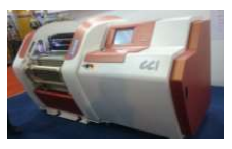
The Studio - Sampling Loom

We had the chance to feature the latest solution for small-scale application which focuses on sample and small quantity production. Among a total of four types of live demonstrations CCI showed how these innovative machines can be utilized and combined to your current factory facility or studio to enable the exceptional energy & cost efficiency for your weaving application.